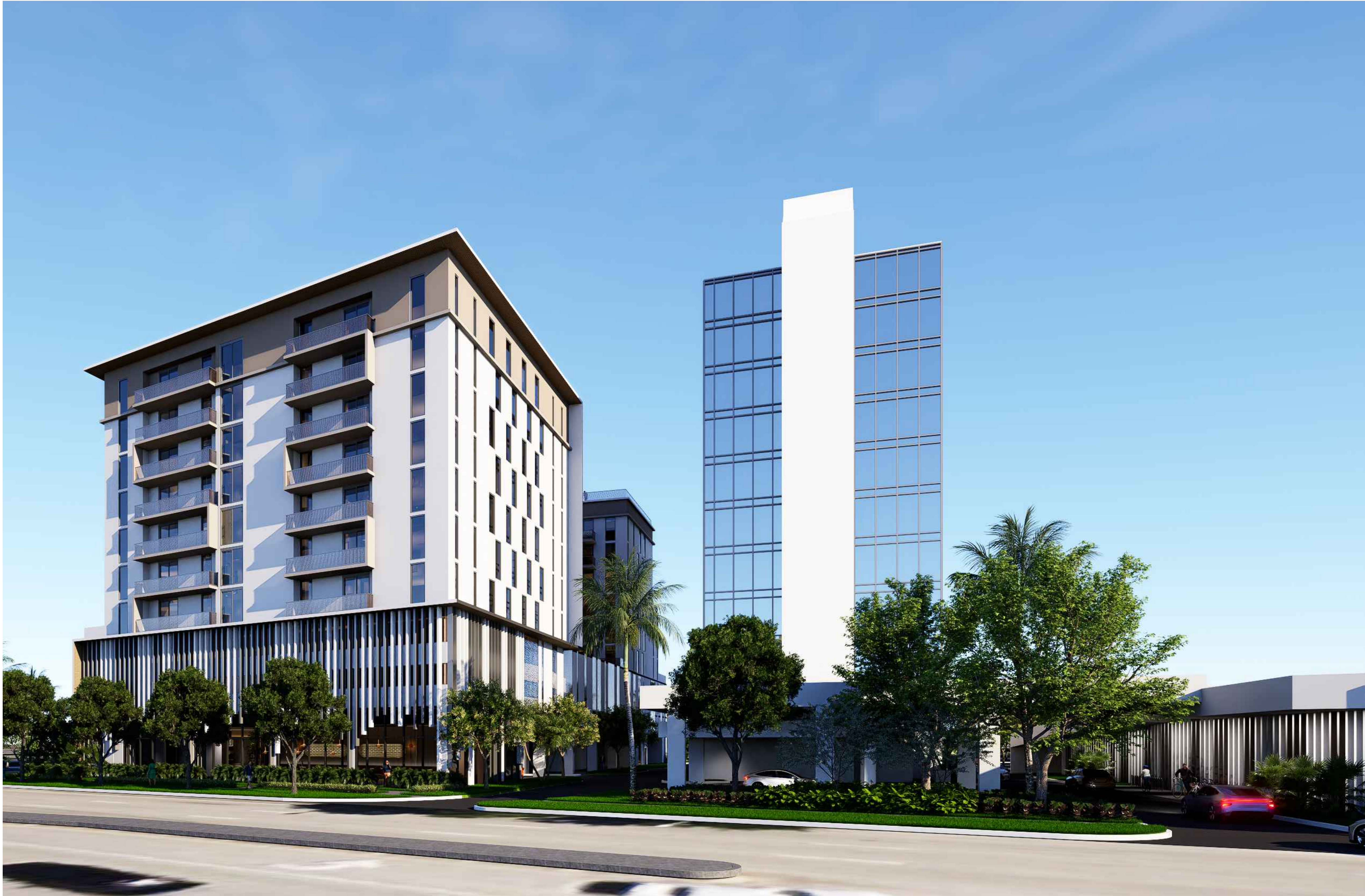
STREET VIEW OF THE SOUTH WEST CORNER OF THE BUILDING